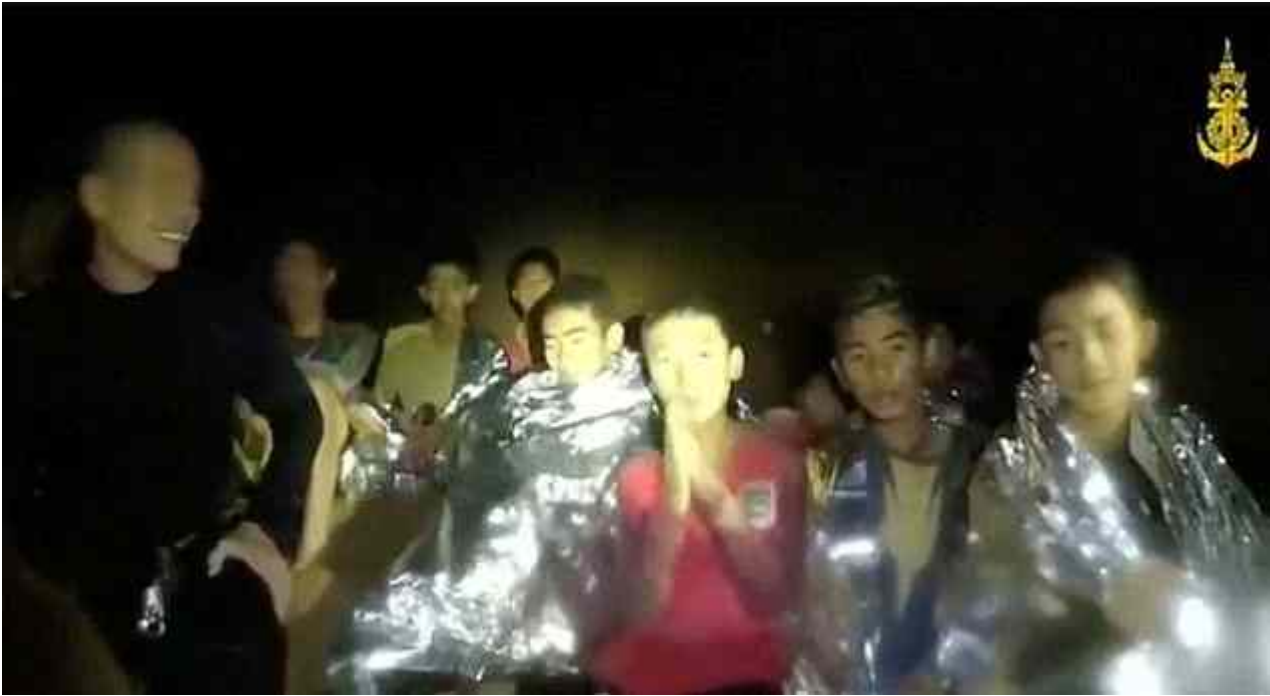
On June 23, 2018, a group of 12 boys, aged 11-16, and their 25 -year-old soccer coach were trapped in the Tham Luang cave system in northern Thailand. Unsworth saved them