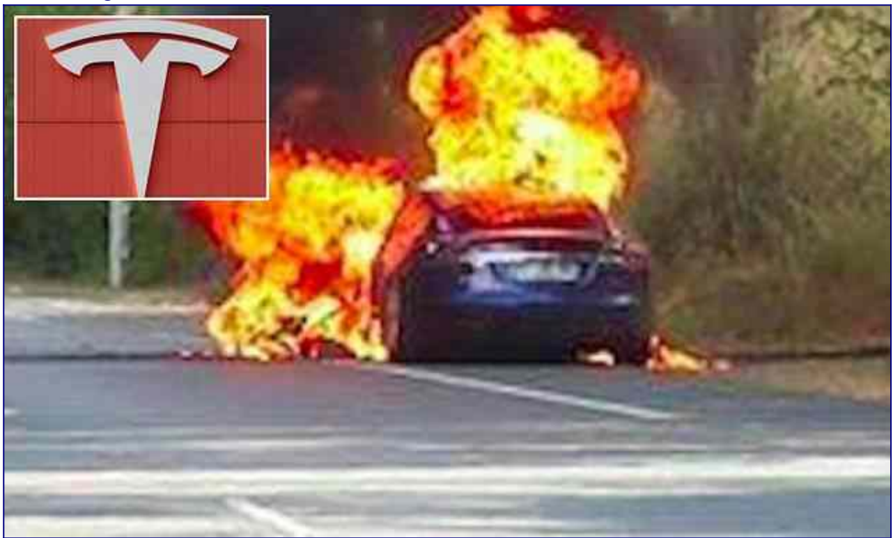
Four people dead after a Tesla erupted into flames in France 1.3k viewing now