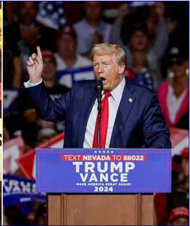
Telltale signs Joe Rogan is preparing for interview with Trump 316 viewing now